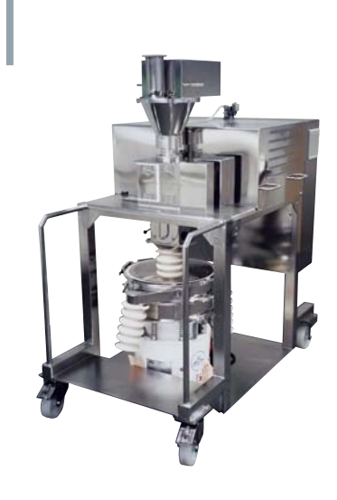
RC 100 Pharma with integrated separator