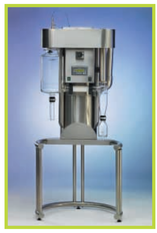
SD-06 Main unit on stand.

Most solutions and suspensions can be spray dried providing that the resulting product has the characteristics of a solid material.