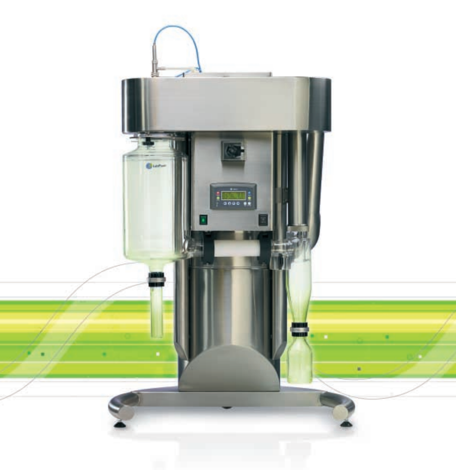
SD-06 Laboratory Scale Spray Dryer